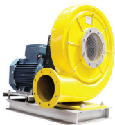
MAb Bio-Gas Series High Pressure Blowers

Eurovent can effectively and efficiently process and boost biogas at a variety of production stages, helping to complete the transfer to combined heating and power usage; or to use as vehicle fuel for buses, police cars, waste transfer trucks and other municipal fleets. Spencer blowers can also be used in sludge drying to make compost and fertilizer.